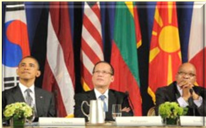
United States President Barack Obama, Philippines President Benigno Aquino and South African President Jacob Zuma at the Open Government Partnership launch, New York, 20 September 2011

President Jacob Zuma joined 45 other world leaders on 20 September 2011 in formally launching the Open Government Partnership (OGP), a new international initiative aimed at securing concrete commitments from governments, in partnership with civil society. The objective of OGP is to promote transparency, increase civic participation, fight corruption, and harness new technologies to strengthen governance.