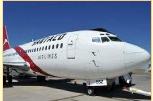
Santaco Airlines will initially operate one or two flights a day between Lanseria in Gauteng and Bisho in the Eastern Cape