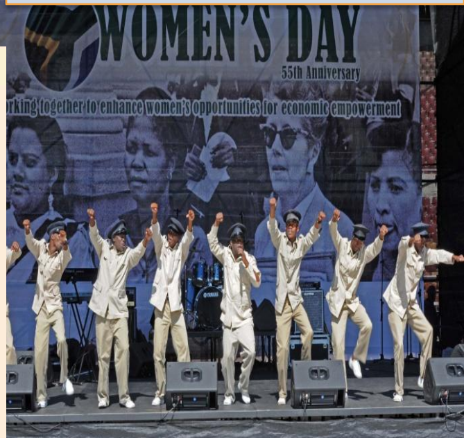
Women's Day Celebrations 9 August: Photo GCIS and DIRCO

The feisty group left bundles of petitions containing more than 100 000 signatures at the office doors of then-Prime Minister JG Strijdom and stood silently for 30 minutes outside his office.