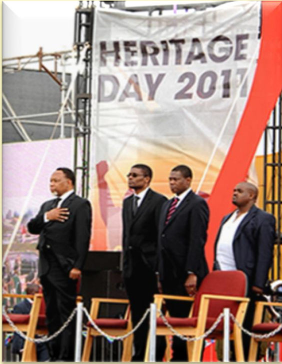
Acting President Kgalema Motlanthe addresses 2011 Heritage Day celebrations held at Gert Sibande District Municipality in Mpumalanga.

LISTEN TO THE SOUTH AFRICAN NATIONAL ANTHEM