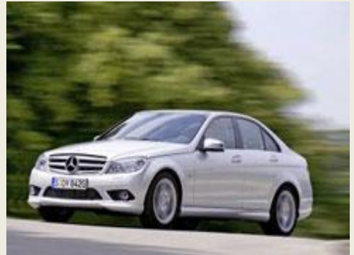
Mercedes-Benz manufactures the C-Class luxury sedan, for both the domestic market and for export, at its plant outside East London