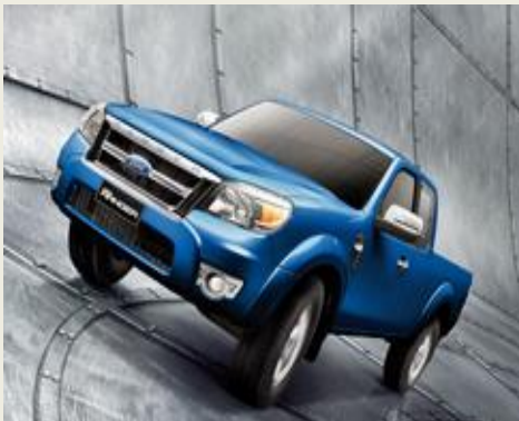
A Ford Ranger pickup truck. The Ford Motor Company of South Africa has invested R3-billion in its plant outside Pretoria to produce the new Ranger, codenamed T6

Ford said it was investing more than R3-billion in the Struandale engine plant in Port Elizabeth for the Puma engine, as well as in the Silverton assembly plant in Pretoria for the production of the new-generation Ranger compact pick-up – with most of the capacity destined for export markets when the projects came on line in 2011.