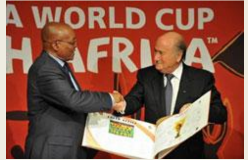
South African President Jacob Zuma and Fifa President Sepp Blatter at the launch of the 2010 Fifa World Cup Legacy Trust, Johannesburg, 13 December 2010

The trust amounts to USD 100 million, USD 80 million of which is being allocated directly to social community projects.