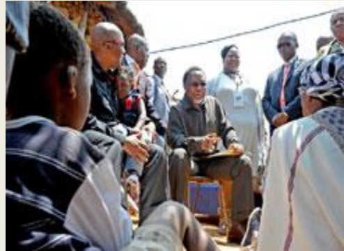
South African Deputy President Kgalema Motlanthe talks with residents of Driefontein, Mpumalanga on World Aids Day, 1 December 2010